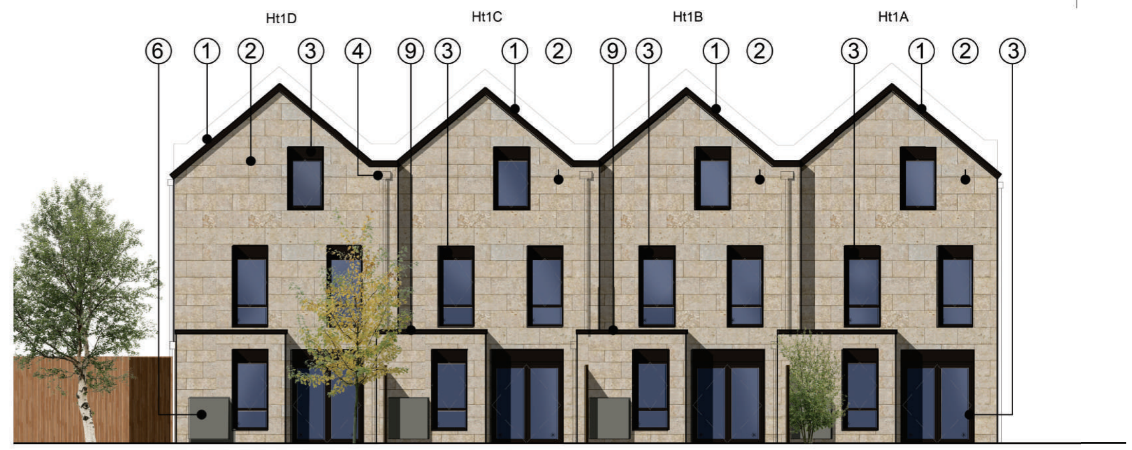
Proposed Rear Elevation - North Facing