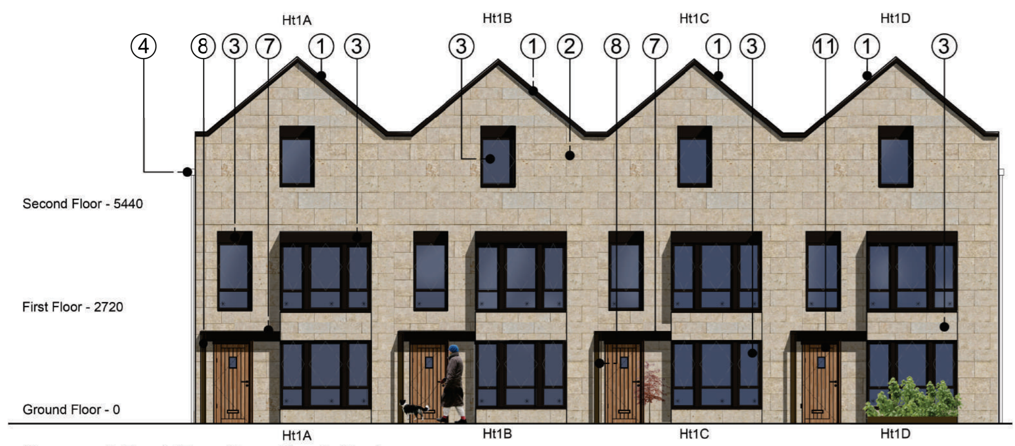
Proposed Front Elevation - South Facing